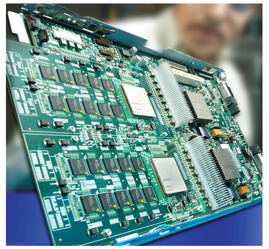
Of the processors studied using the LBMHD problem, the Cell Blade yielded the highest raw performance and power efficiency.

Compared with other processors, the Cell processor provided the highest raw performance and power efficiency for LBMHD. This processor's design calls for a direct software control of the data movement between