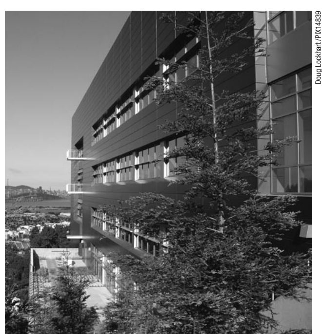
Figure 2. Exterior view (south side) of the Molecular Foundry