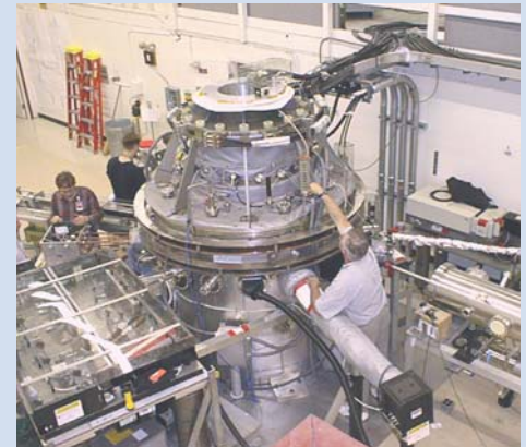
The SSPX at Lawrence Livermore.

The resulting simulations produced using the NIMROD code on NERSC's Seaborg super-