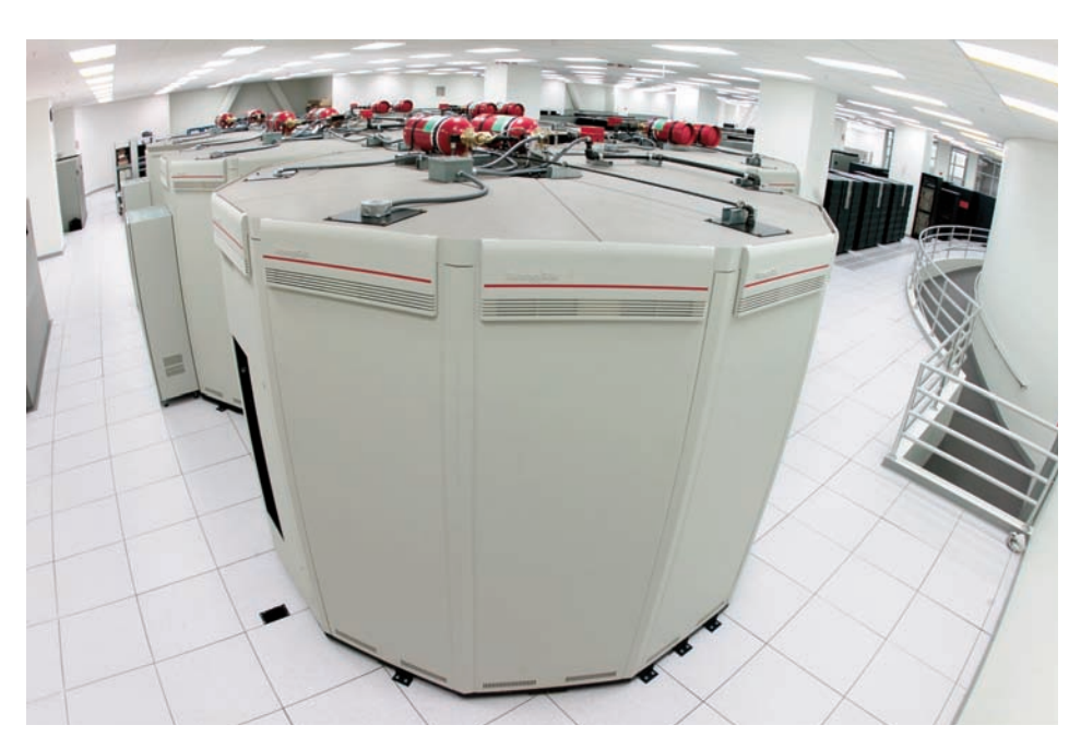
Cost Efficient Archive: HPSS at NERSC archives petabytes of data on systems consisting of spinning disks and tapes.

The oldest science file saved in HPSS dates back to January 2, 1976. As of January 27, 2009, NERSC's archive HPSS contained over 66 million files, adding up to over 3.9 petabytes of data. Meanwhile, the backup HPSS holds over 12 million files, which add up to 2.8 petabytes of data.